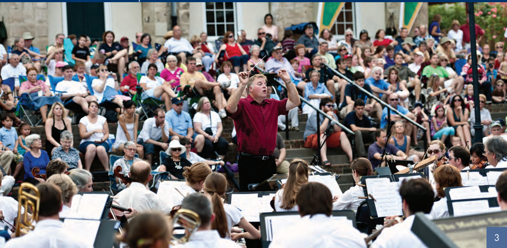
Philharmonic at Historic Market Square