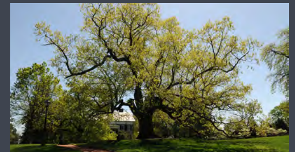
The Brompton Oak

restorations. In 1979, Brompton was placed on the National Register of Historic Places. The home retains its original heart pine floors, and houses an eclectic and varied art collection, along with a number of antique furniture pieces, all of which are owned by the University. The Brompton complex includes the main house, two guest houses, and a kitchen garden with a pond.